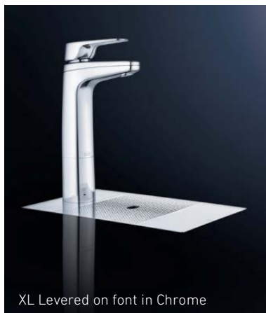
XL Levered on font in Chrome

Instant boiling, chilled & sparkling filtered water